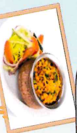
Nutritious main meal

We offer different coloured vegetables and fruits to provide your children with the vitamins and minerals they need.