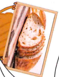
Freshly baked bread