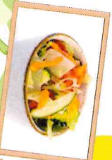
Trip to the salad bar